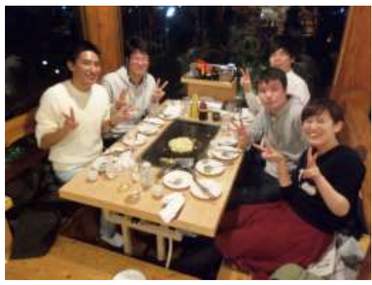
• January 15<sup>th</sup> 2017

I spent the day with some Spanish friends. They were very friendly. We decided to go to the Odaiba area which is characterized by great technology and tourist areas. I found it a beautiful place where I could find a small part of New York, the Statue of Liberty.